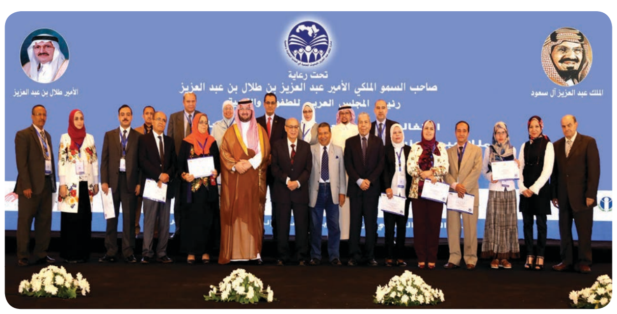
HRH Prince Abdulaziz bin Talal with the winners of the First Cycle and the Scientific Committee.

Emerging from its vision and strategic orientation, ACCD has established a Prize in the domain of social and pedagogic research to present scientific researches around issues related to childhood and development and child rights. This emphasizes ACCD's role in stimulating discussions around the child's upbringing issues, collecting information to understand and tackle the status of children's upbringing. This role derives from ACCD's status as a house of expertise, producing and supporting national and regional guiding policies that achieve the child's best interests in the Arab nations.