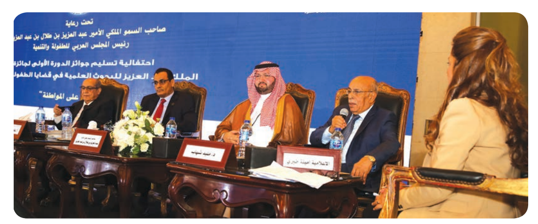
An open dialogue around citizenship and upbringing during the Awards Ceremony of the Prize's First Cycle.

In June 2019, HRH Prince Abdulaziz bin Talal bin Abdulaziz launched the Second Cycle of the Prize entitled: "The Empowerment of Arab Children in the Era of the Fourth Industrial Revolution" to explore and discuss a number of concepts and the cognitive and scientific components of this new industrial revolution, in the light of an interconnected, integrated, conceptual structure. This is in accordance with a new intellectual layout that establishes an organic relationship between the child and the FIR, within the framework of a global awareness, under the slogan of 'A New Mind, for a New Human, in a New Society'.